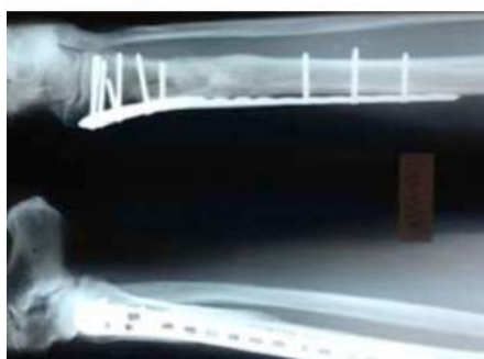
3 Initiation of healing by HFT® of a fracture in a 76-year-old female patient.

formerly known as natural sound therapy, has enabled both forms of therapy to establish ever more precise scientific foundations and successes. An increasing number of medical doctors and therapists such as alternative practitioners, physiotherapists, ENT-specialists and psychologists participated in these seminars, which opened up the biophysical, scientific applications of this method and provided additional exciting insights.