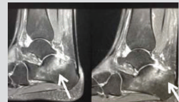
Bone oedema following fracture of the cuboid heel bone left before / right after HFT®